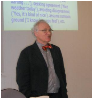
Pr Mick Short